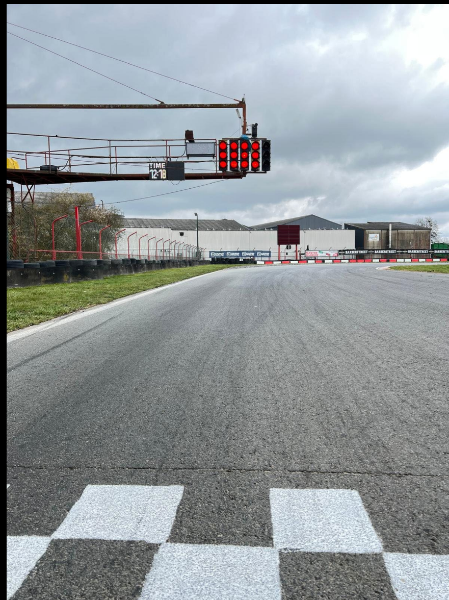
Picture of RED lights ON

RED lights & Orange flashing light are ON. One extra formation lap.