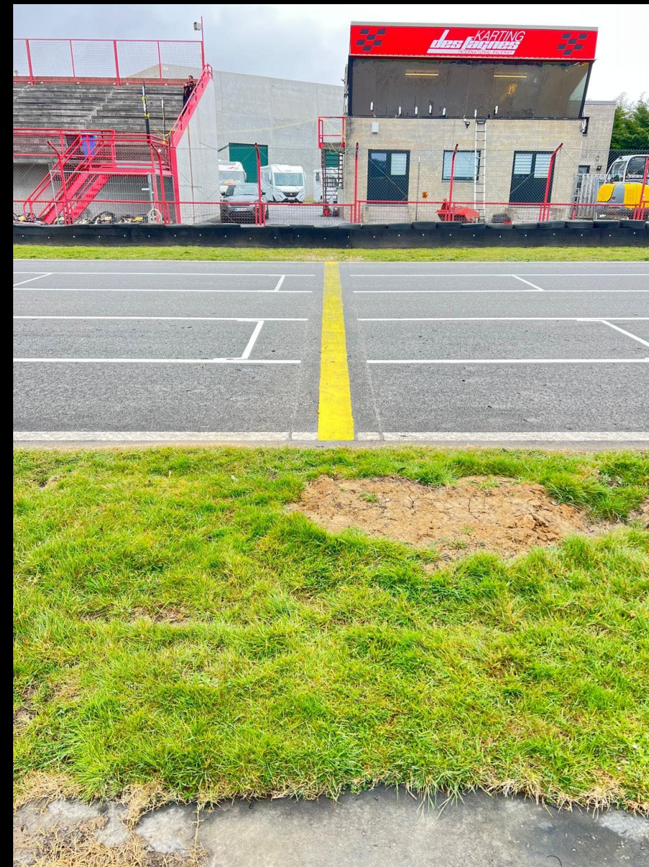
Picture of YELLOW line painted on track 25 mtrs in front of Startline