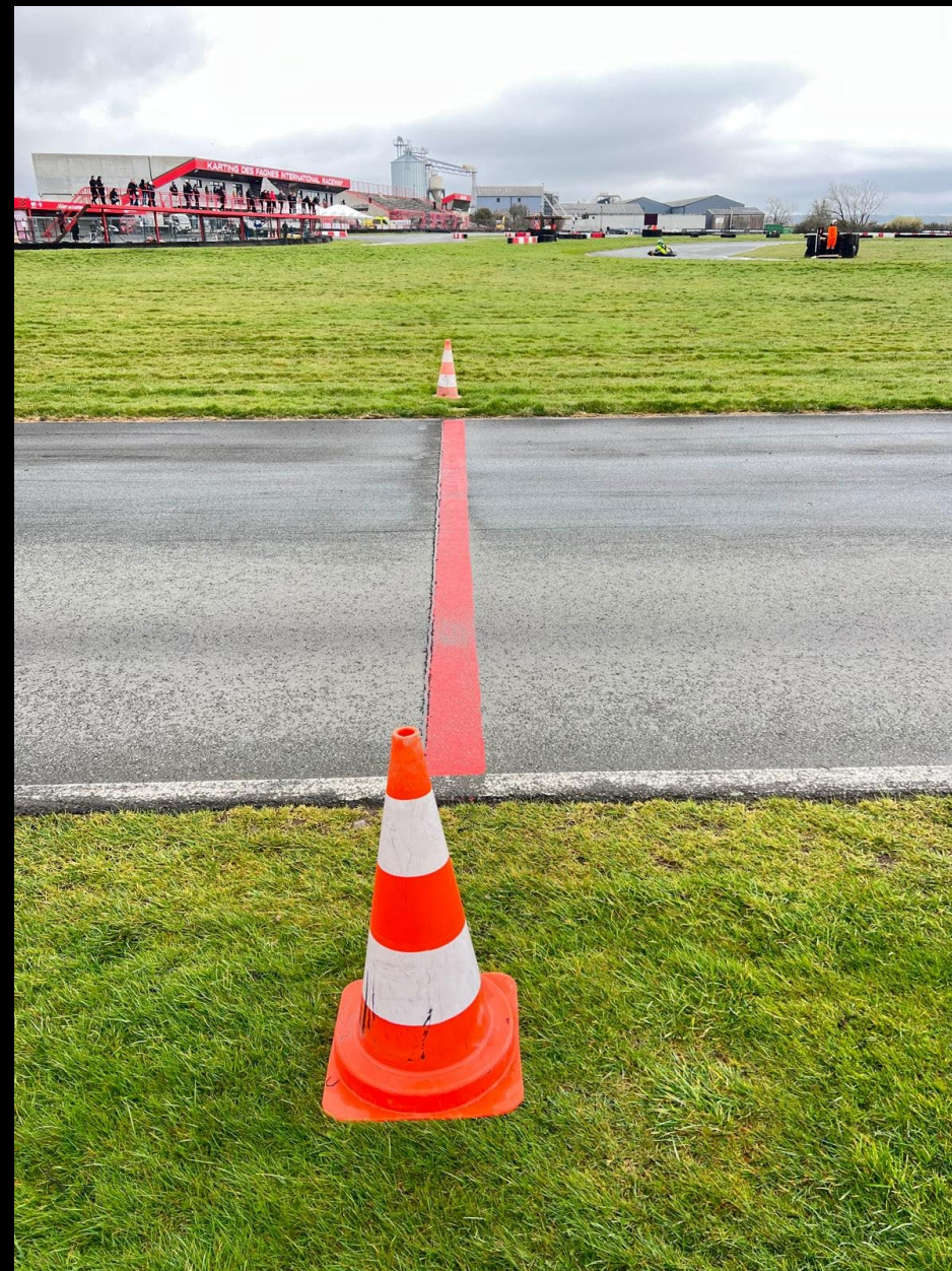
Picture of RED line painted on track approaching Post 11

Between Red line and Yellow line reasonable speed