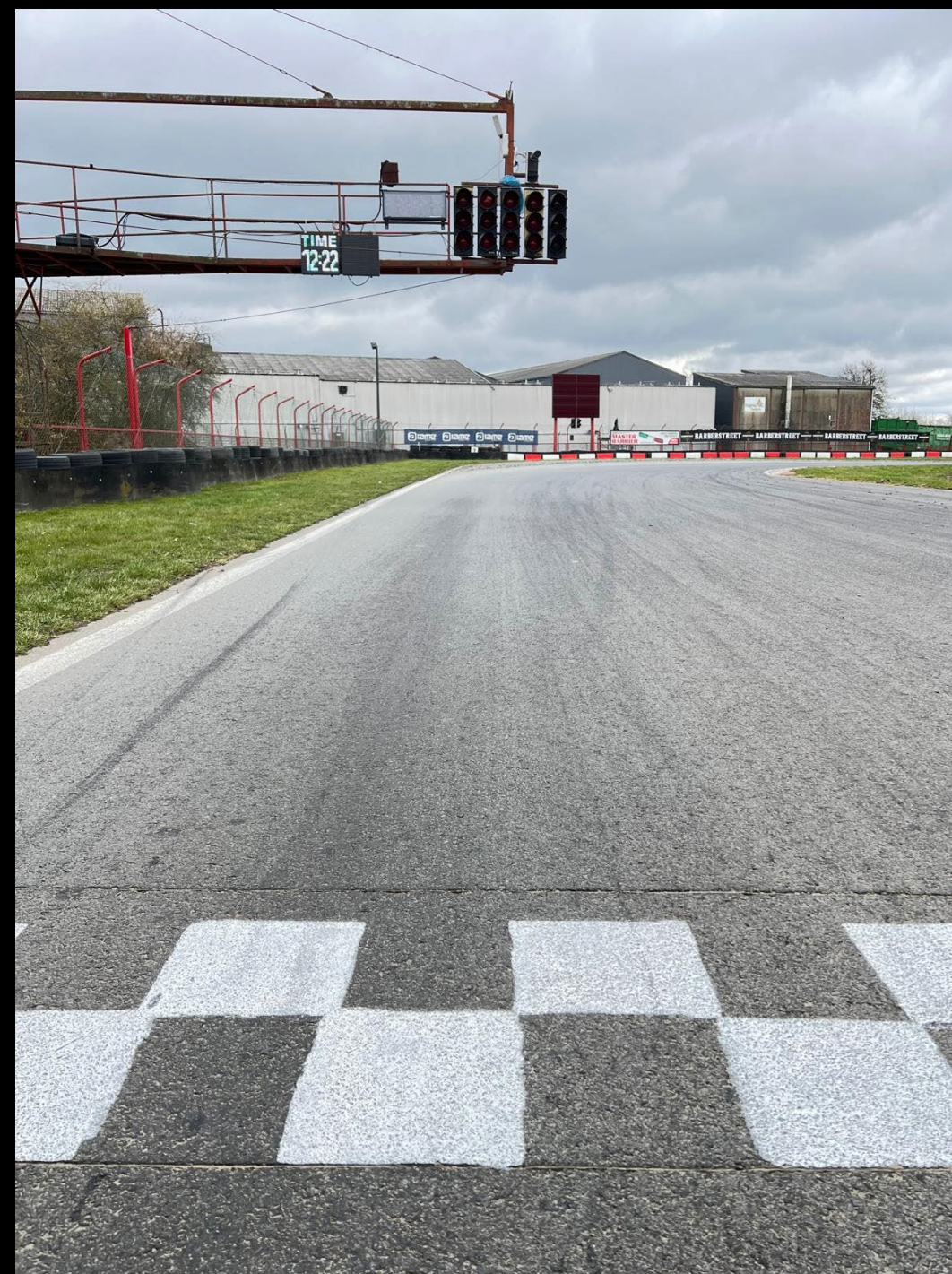
Picture of ALL light OFF